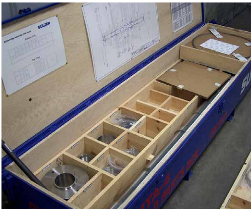
The Sulzer parts box

The Sulzer parts box is the answer to managing risk. Sulzer as a leading provider of OEM quality parts for pumps offers the Sulzer parts box as your spare parts solution for all pump ranges related to power generation. It contains a complete set of parts to repair critical equipment and return it back to service in the shortest amount of time.