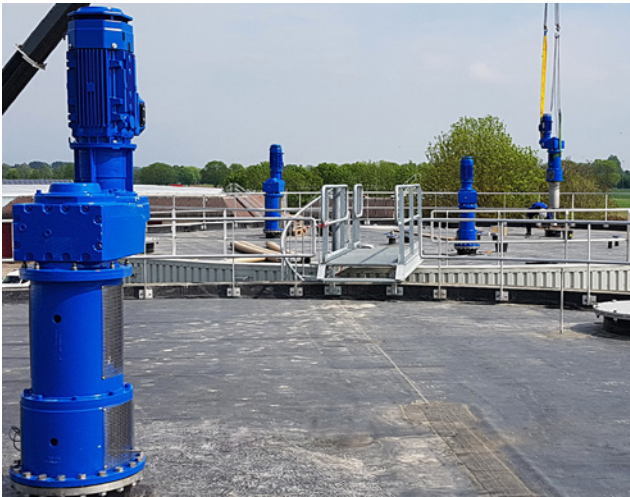
A total of five Scaba agitators were installed in the reactor tanks

Sulzer technology is playing a key role in Energiefabriek West, an innovative bio-power scheme in the Netherlands. The Rivierenland Water Authority in the Netherlands is investing in new infrastructure to improve the performance of its wastewater treatment systems while also reducing its impact on the environment. The utility is aiming to become energy neutral by 2030, and Sulzer technology is helping it to realize this goal.