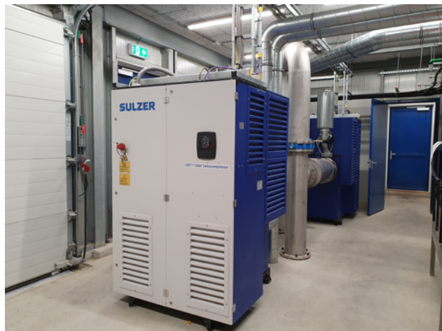
Compressed air for this process is generated by two highly efficient HST 2500 turbocompressors.