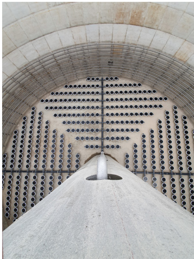
The configuration of the disc diffusers and pipework was designed by Sulzer for optimal efficiency

Construction and commissioning of all the equipment was completed on schedule during 2020. The Energy Factory began full operation at the beginning of 2021 and has been performing efficiently since.